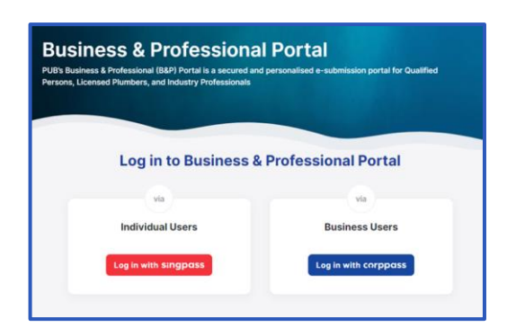
Step 2: Click on the link in the banner located in the B&P Portal Dashboard or visit the following URL: <a href="https://go.gov.sg/bbpsubretrieval">https://go.gov.sg/bbpsubretrieval</a>