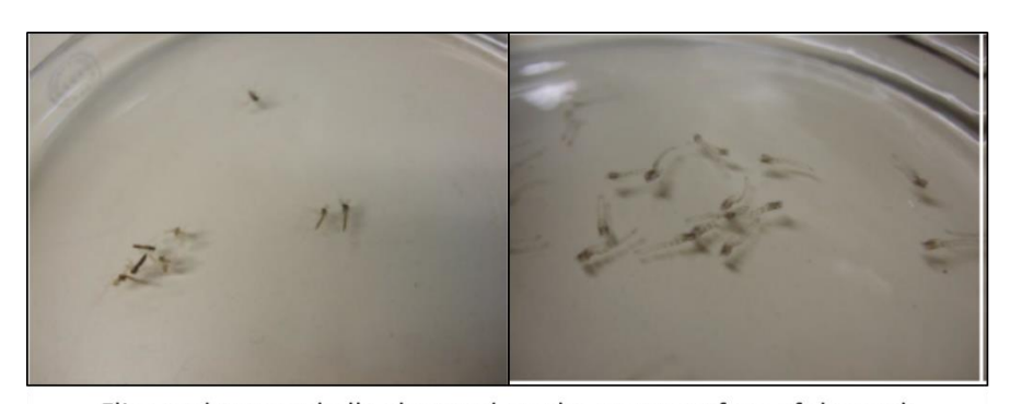
Flies and pupae shells observed on the water surface of the tank