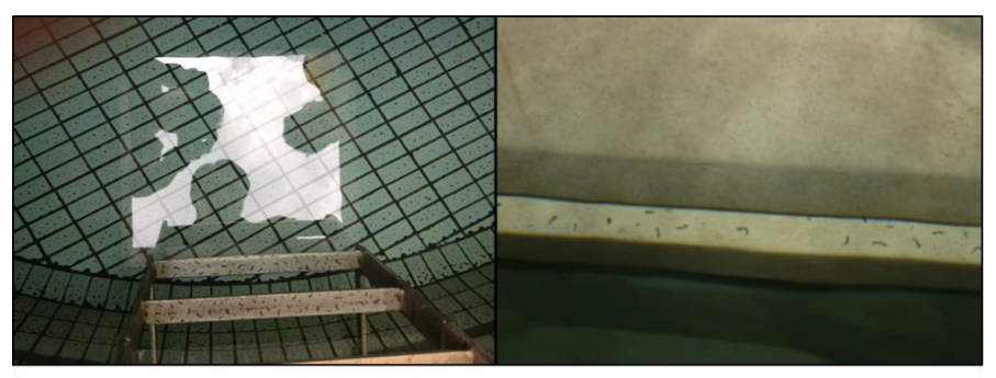
Presence of visible worms/worm case on the side walls/ledge/ladder