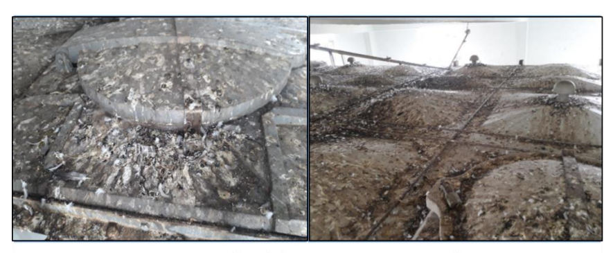
Presence of bird droppings on water tanks