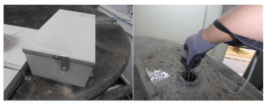
Electode box cover and holder not properly secured